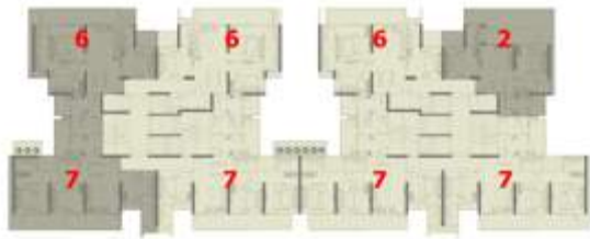
TOWER 2 TOWER 3 CLUSTER PLAN